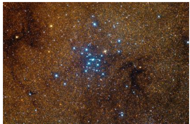
M7 (Ptolemy Cluster). Photo taken in Chile.