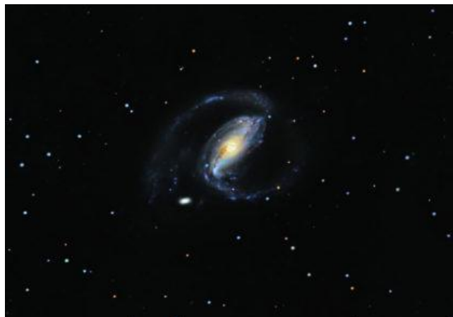
Photo of NGC 1097 taken in Chile.