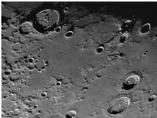
Photo of Crater Posidonius (top left) on the Moon on 6/2/17.