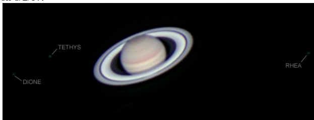
Saturn taken by Chuck Pavlick – June 2017